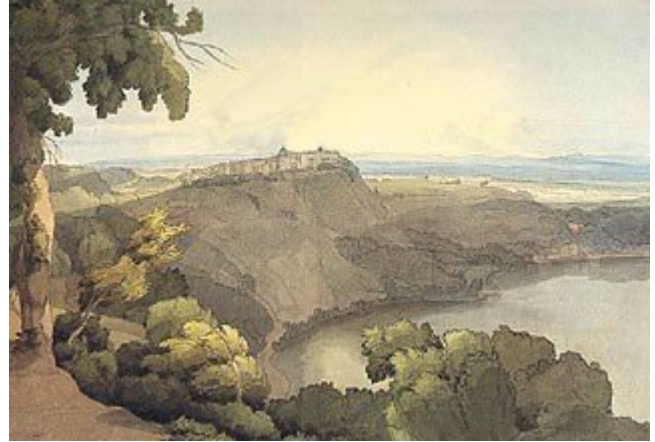
watercolor painting by: Francis Towne (c.1740-1816)

"Winter is an etching, spring a watercolor, summer an oil painting and autumn a mosaic of them all."