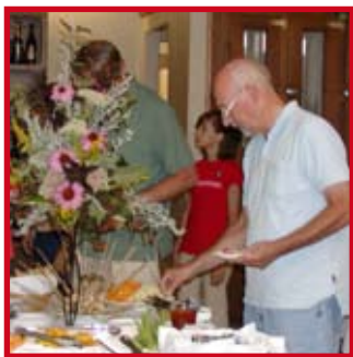
At the buffet during the Masters Reception.

One week later, on Sunday August 26, we had our Fall Showcase Exhibit Opening and the Door County Master Artist Award Reception.